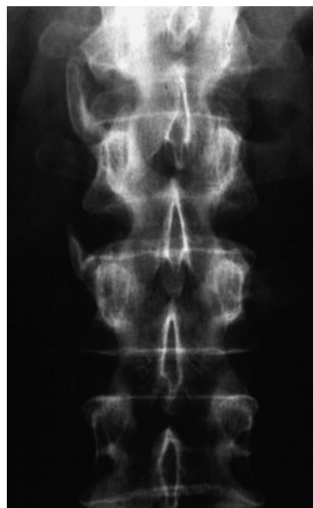
FIG. 3. Axial involvement with characteristic parasyndesmophytes of the spine.

both the immediately adjacent trabecular bone networks and in some cases deep fascia (25). Enthesitis remains an elusive clinical feature: recent data confirmed the poor association between clinical and ultrasonographic enthesitis in PSA (26).