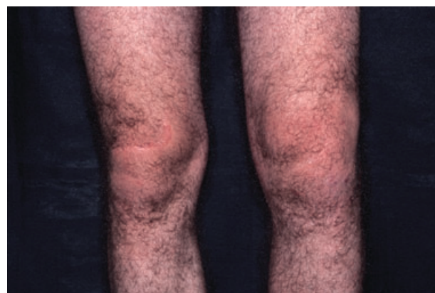
FIG. 2. Goarthritis – one of the more common sites for oligoarthritic PSA.

A very characteristic and often painful manifestation of PSA is enthesitis (FIG. 5). Collectively, the fibrocartilages, bursa, fat pad, and the enthesis itself constitute the enthesis organ. It also includes