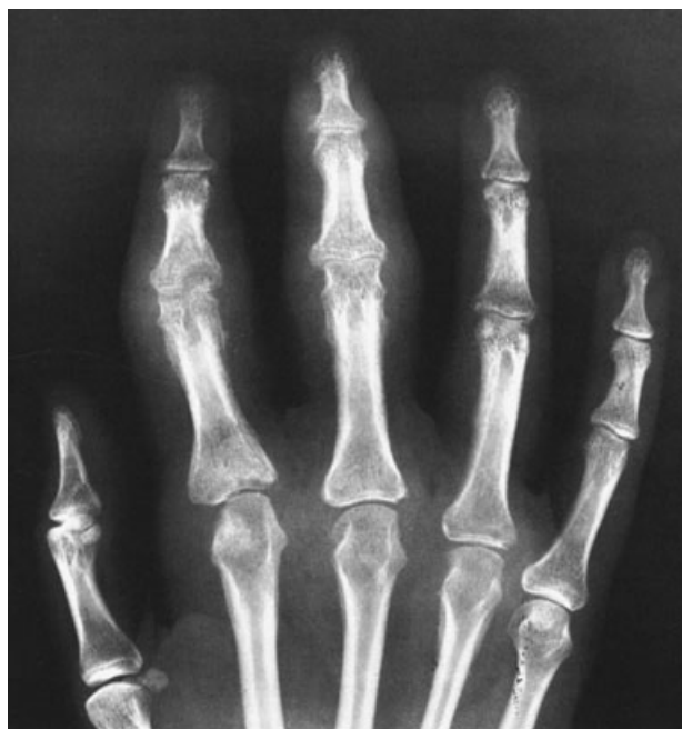
FIG. 4. Dactylitis digit II and II in combination with articular involvement of distal and proximal interphalangeal joints.