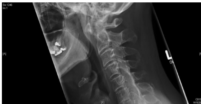
FIG. 9. Cervical spine involvement of PSA, in this case with syndesmophytes.