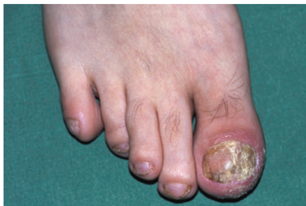
FIG. 6. Pachydermoperiostitis of the great toe in PSA.

Several radiological imaging techniques can be used to diagnose PSA. The typical initial examina-