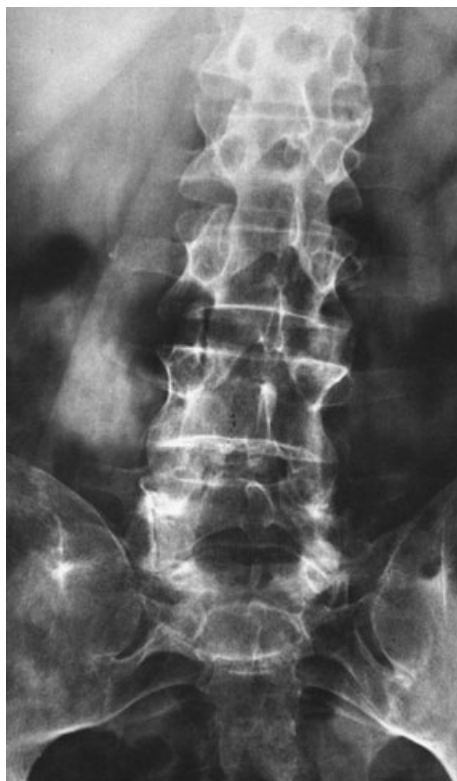
FIG. 8. Bilateral ankylosis of the sacro-iliac joint.

joints are affected in more the 50% of cases, usually bilaterally but asymmetric (FIG. 8). Unilateral involvement occurs in 20%. Isolated sacroiliitis without peripheral symptoms is rare. The combination with spinal affection can be found more frequently (20% lumbar spine). The affected sacro-iliac joint shows blurred contours, subchondral erosions / sclerotic formations, widening of the