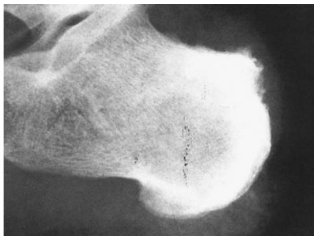
FIG. 5. Enthesistis at the insertion of the Achilles tendon.

(FIG. 6). Therefore, nail involvement may be an indicator for PSA (29). The 20 MHz sonography is a useful tool for follow-up of nail disease (30). Like other spondylarthropathies, PSA has an increased risk for acute anterior uveitis with a prevalence of 25.1% (31).