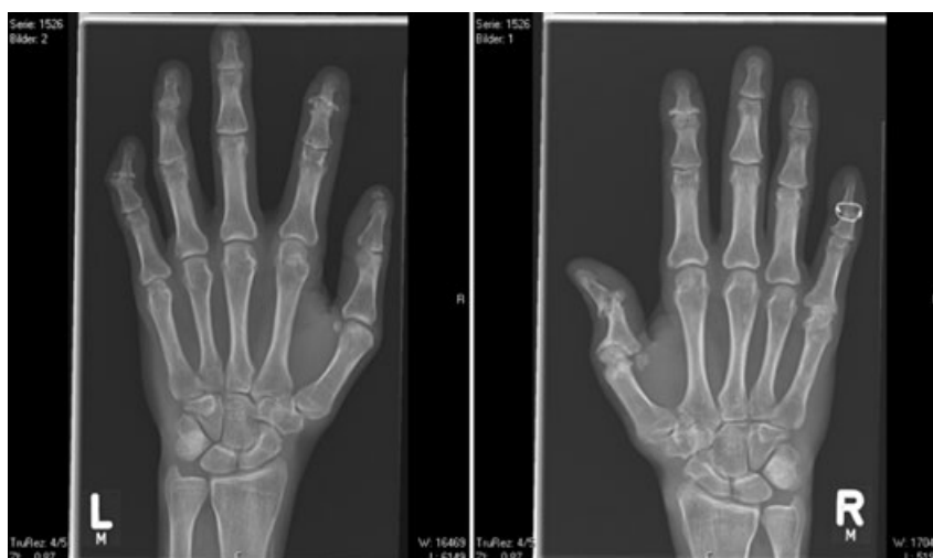
FIG. 7. Typical erosions and mutilation with “pencil-in-cup” formation of distal interphalangeal joints.